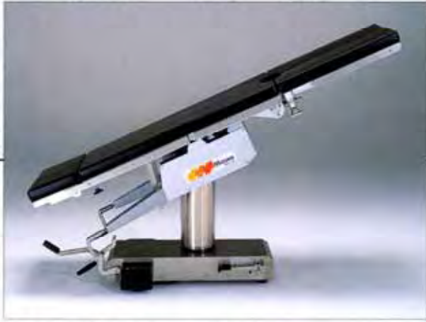
● Trendelenburg position