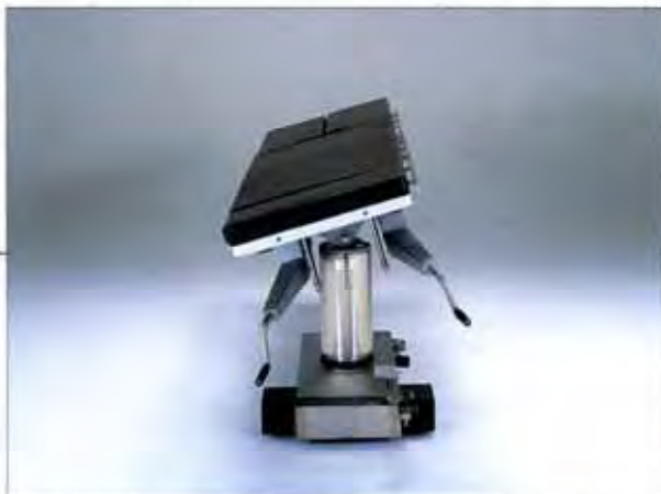
● Lateral-tilt position