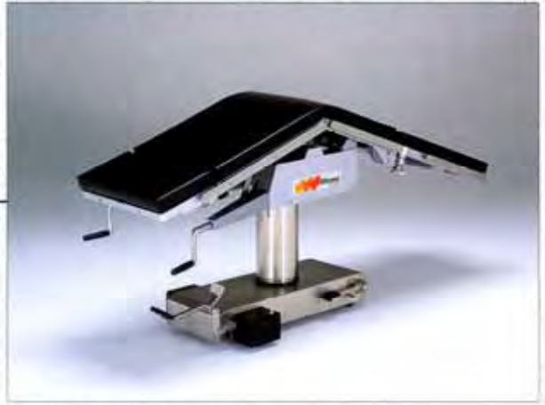
● Kidney position

Knurled knob for attaching/detaching the Head Section