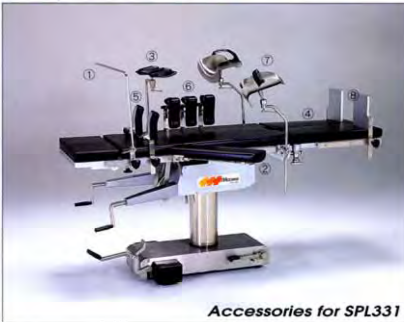
Accessories for SPL331