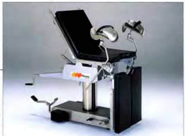
● Urological position